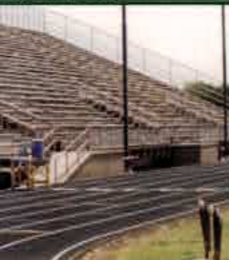
on, TX (5-5A)