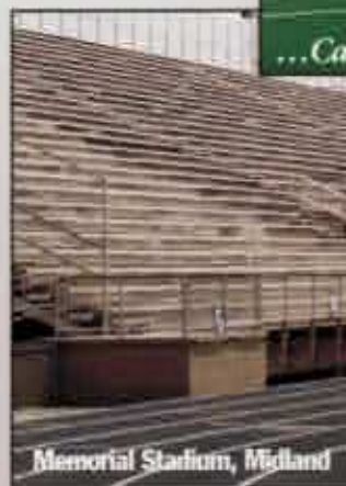
Memorial Stadium, Midland