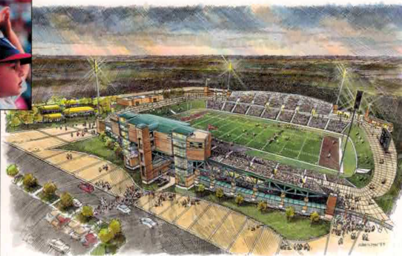
Artist's rendering of new football/soccer stadium