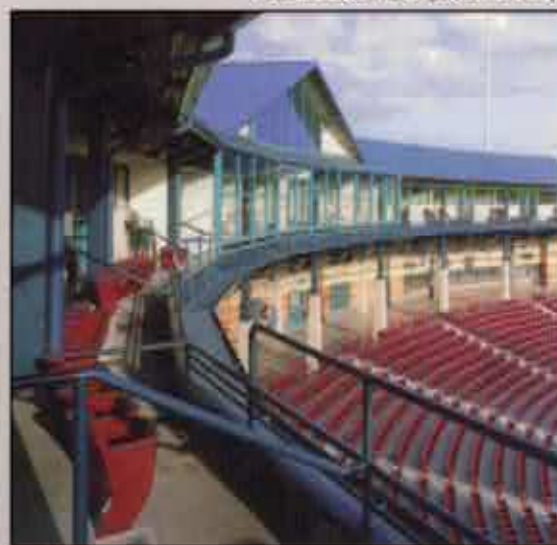
...Lake Elsinore, CA (Single A)