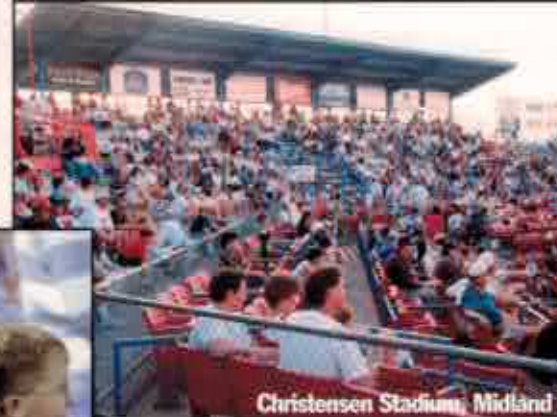
Christensen Stadium, Midland