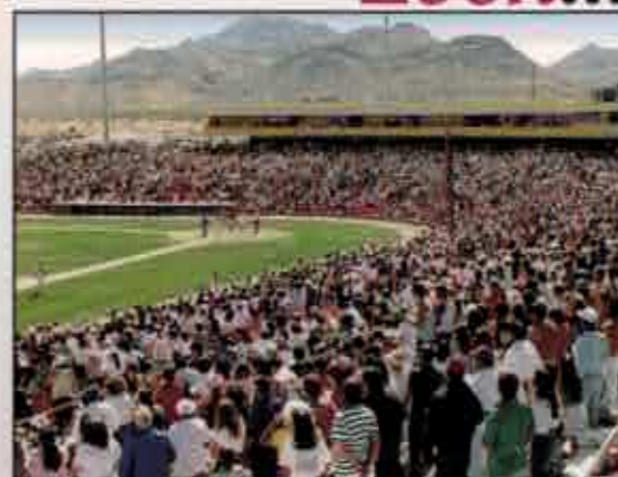
...El Paso, TX (Double A)